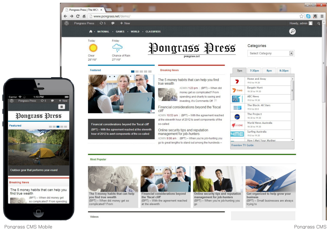
Pongrass CMS Mobile

WordPress Widgets are an industry standard and provide dynamic content to the Pongrass CMS system. Included are Widgets for ad placement, ad and story rotators, user login, letters to the editor, weather, stock-ticker, classified advertising, etc. Special requirements can be quoted and provided by Pongrass or developed in-house.